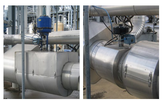
Before and after – Sliding gate valve DN250 in operation in the steam filter station at EVAL Europe N.V. in Antwerp.

"An additional plus provided by the Schubert & Salzer sliding gate valves is that we can carry out valve adaptations and the maintenance of the fittings ourselves. ", says Hellemans. "Plant modifications can result in changes being made to the KVS value. In such cases, we can install new sealing discs with a modified slot contour and thereby adapt the control valve to the new process requirements ourselves. With all the other valve types, we had to send the fitting to the manufacturer to make the modification. These optimizations are not frequently required but if it should be the case, they are quickly and easily carried out ourselves. "