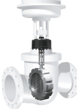
Size comparison between a normal seat valve and a Schubert & Salzer sliding gate valve. In the example, the nominal size of both valves is identical.