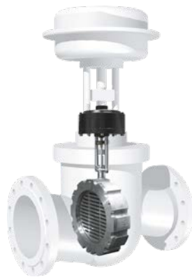
Size comparison between a normal seat valve and a Schubert & Salzer sliding gate valve. In the example, the nominal size of both valves is identical.